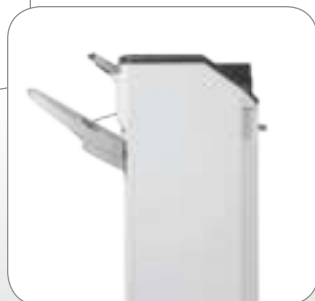
3,000-Sheet Multi-Tray Finisher