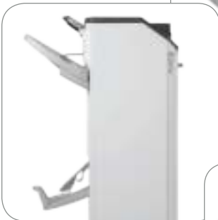
2,000-Sheet Booklet/ Saddle Stitch Finisher