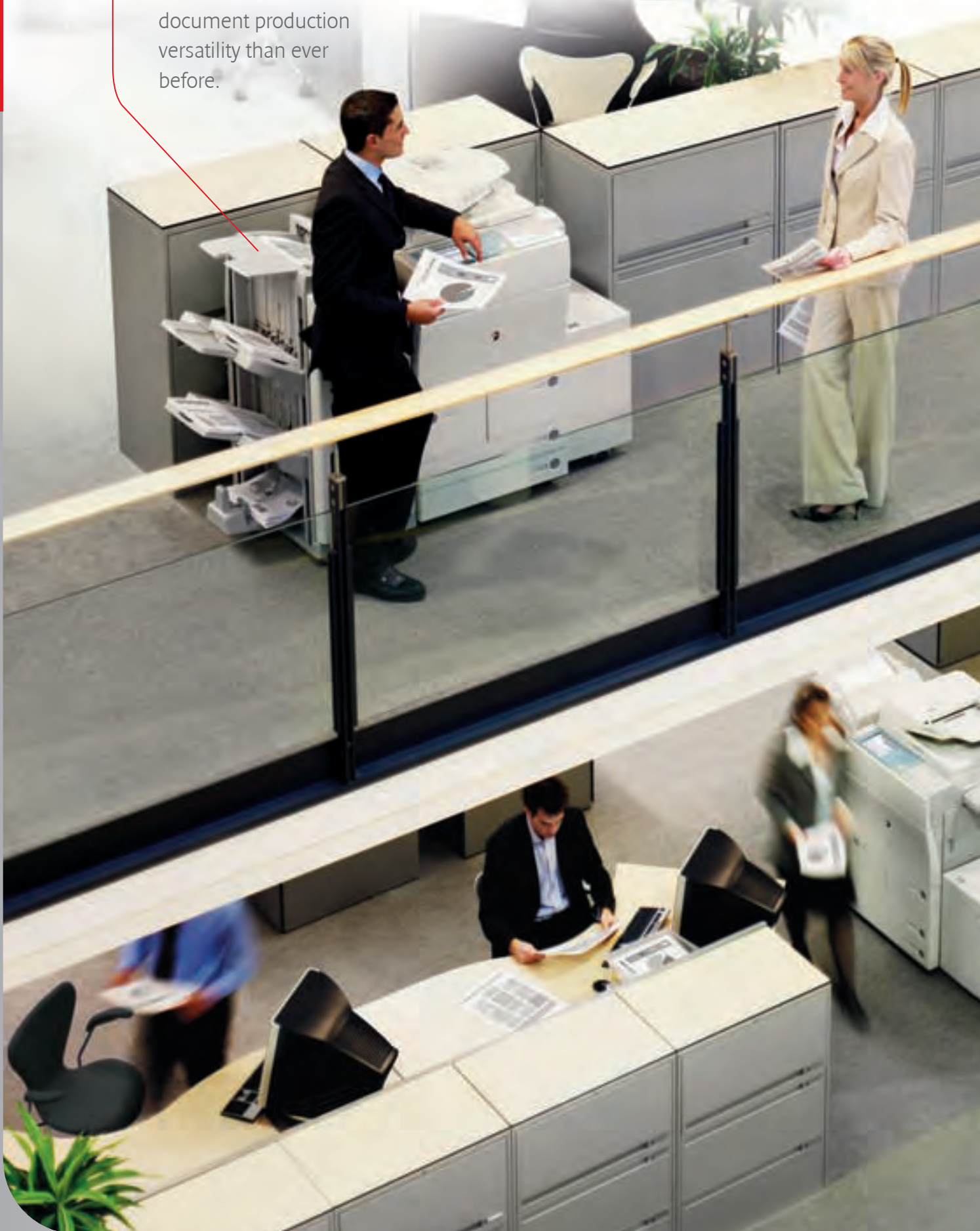
Black and white intelligence that supports you in the office

The iR 5570/6570 devices offer more document production versatility than ever before.